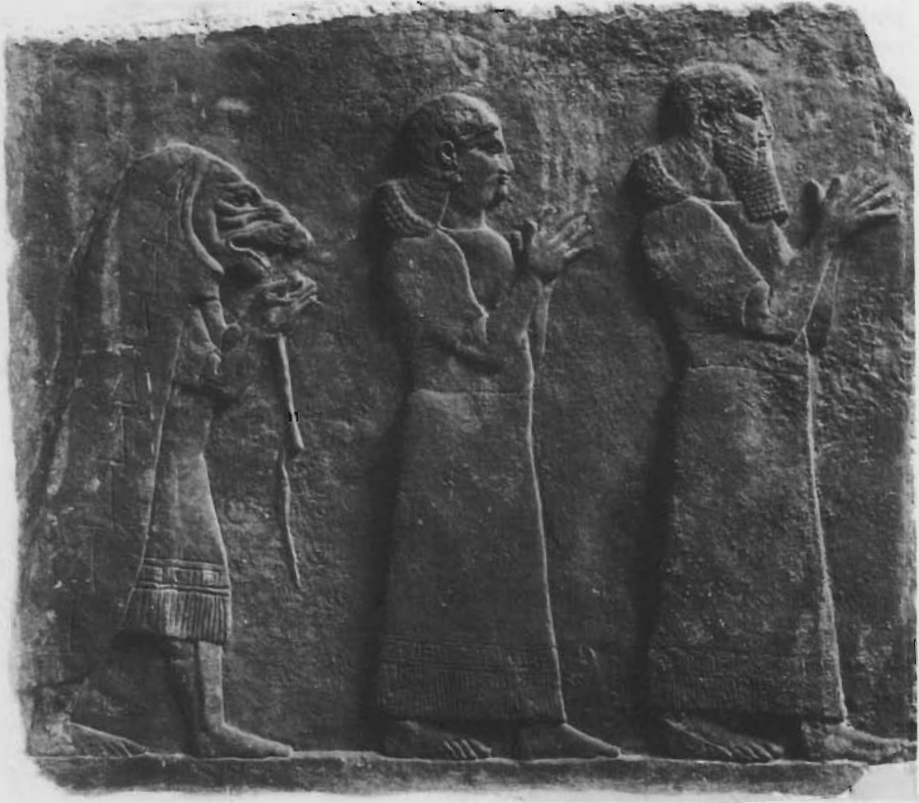
Fig. B. From a relief in Tiglath-pileser III's palace.